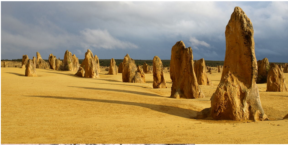
The Pinnacles Desert_