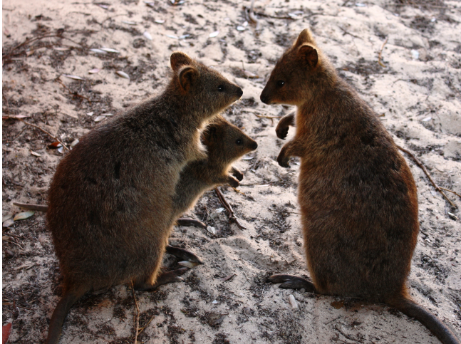
Quakka family in Rottnest Island_

Next up, make a visit to the only metropolis of Western Australia, Perth! Enjoy the wonderful city park, "Kings Park," spreading out over 1.5 square miles and covered with flowers. Here you can also take the ferry from Perth to Rottnest Island, a paradise completely detached from civilization which holds a spiritual significance for Aboriginal Australians. The white sand beaches are teeming with quokkas, a small marsupial that can only be found in this part of Western Australia.