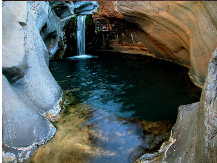
Karijini National Park_

The next day, head to Karijini National Park, an true oasis in the desert. The second largest national park in Australia, it boasts several waterfalls and natural swimming holes. Set out on one of the spectacular hiking trails, and rest up by camping at Dales Campground (10A$ per person), or opt for the more luxurious Karijini Eco Retreat Campground