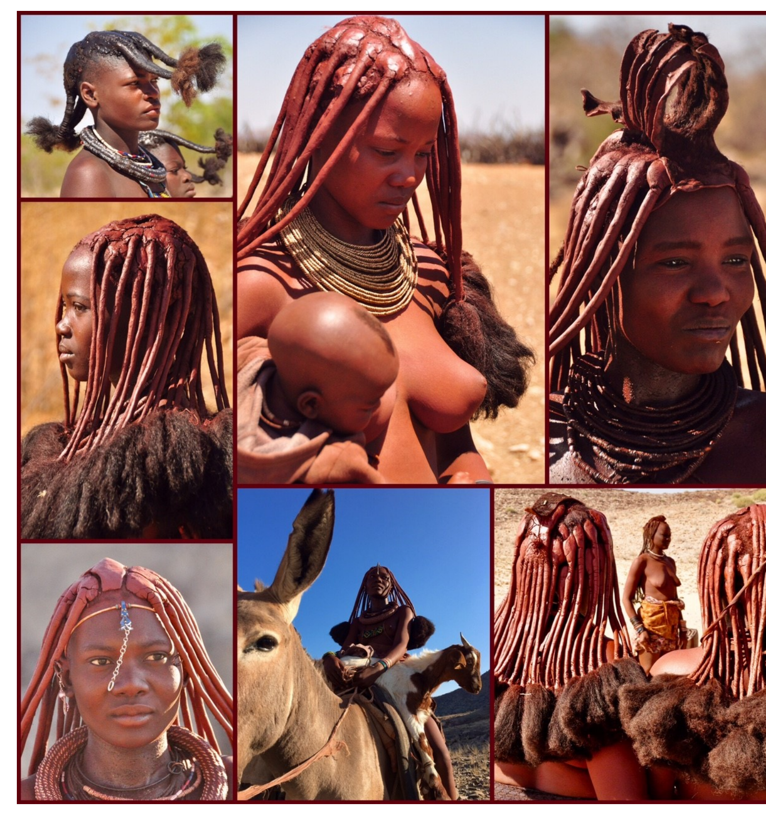
To be continued... Namibian 4x4 Road-Trip Part 2