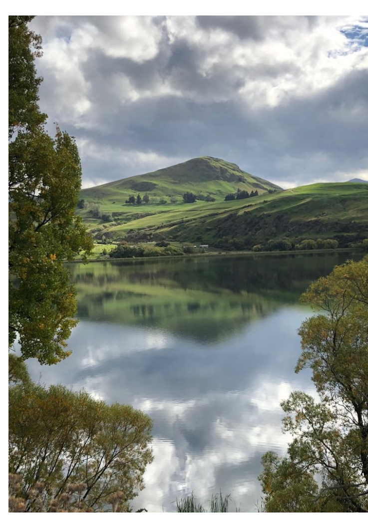
Our next stop was Wanaka (3 hours drive) and we spend the day around to visit and enjoy the scenery. After a restful day, we head for the hike around Lake Wanaka. The landscapes are breathtaking! When we return from our walk, we take the road to Tekapo (2h).