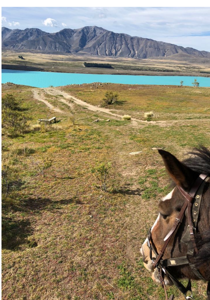
The next day, a day rich in emotion awaits us. Lifted early because we make a ride a helicopter, it was magic to fly over lake and mountain. Guaranteed sensations! Then we leave for a horse ride in the mountains. The experience and unique, it's a really nice way to discover the landscapes of Tekapo Lake