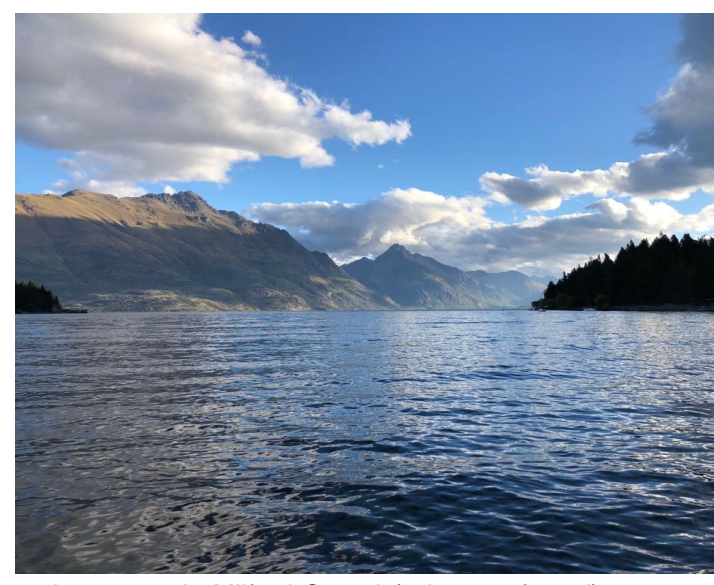
Thanks to our vehicle, we are very free and independant. We leave then towards Milford Sound (2 hours of road) where we make a cruise. The cruise is really nice because there are not too many people on the boat and especially we could see seals and dolphins! We return to spend the night at Te Anau campsite.