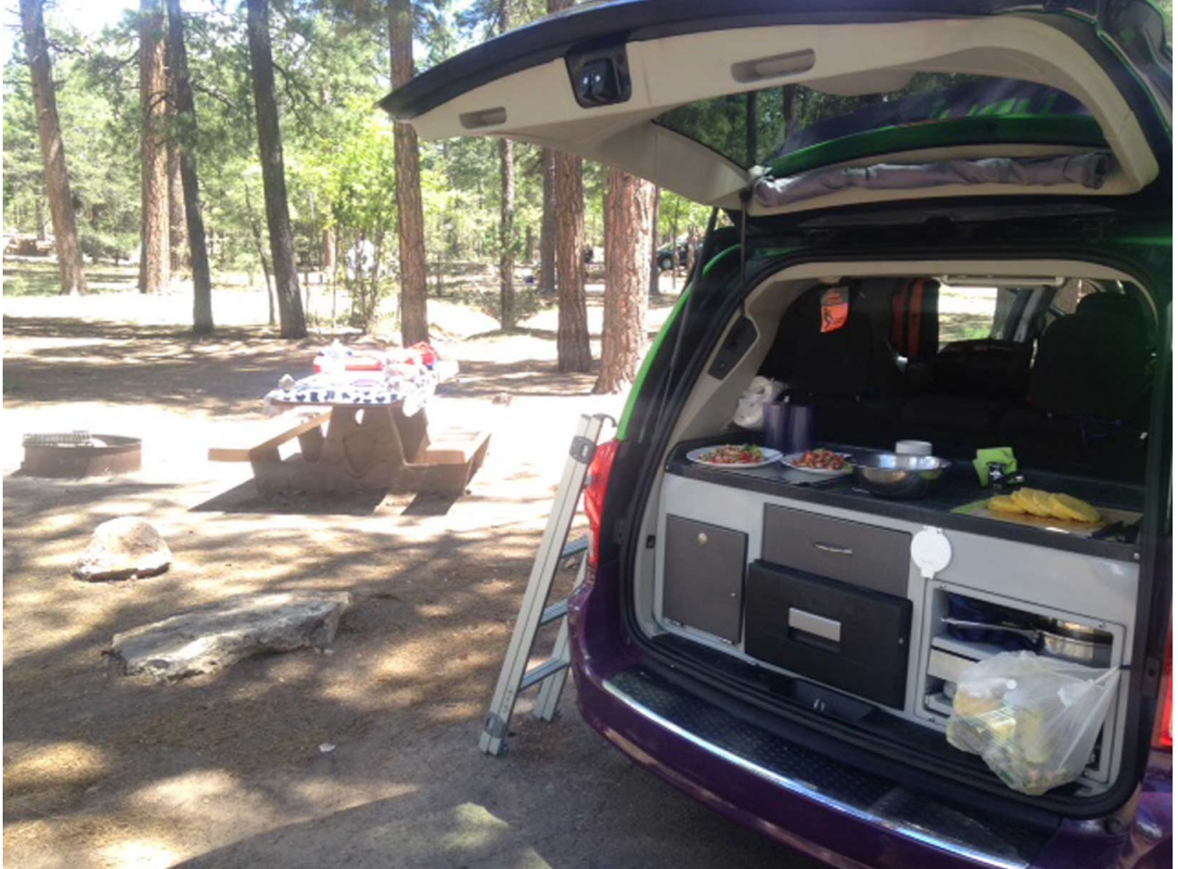
"Another wonderful campsite: Lees Ferry Campground in Marble Canyon, with a view over the Vermillion Cliffs and the Colorado River"