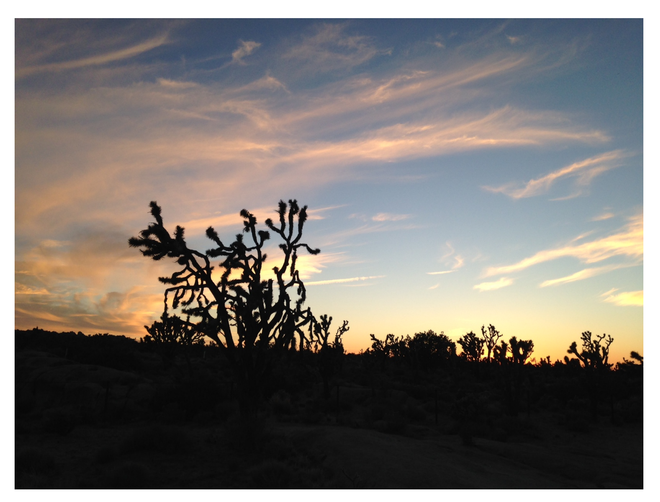
"A magical evening in the Mojave Desert. "