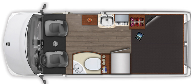
Roadtrek Simplicity SRT