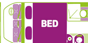
FLOOR PLAN NIGHT (LOWER LEVEL)