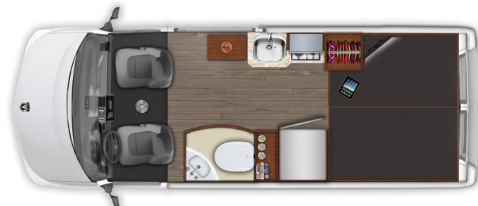
Roadtrek Simplicity SRT